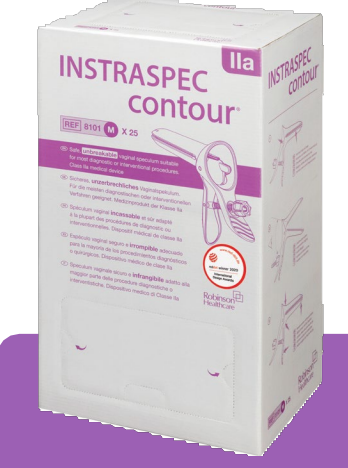
Convenient dispensing case with choice of three perforated access windows